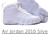
Air Jordan 13 Retro shoes black white ID:6061 Free Shipping